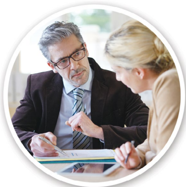
BOTOX® Patient Flow Assessments