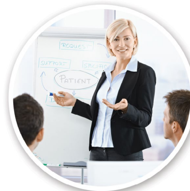
BOTOX® Education and Training Resources