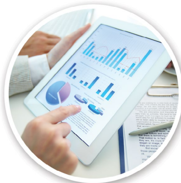
Considerations for Appropriate BOTOX® Billing and Coding